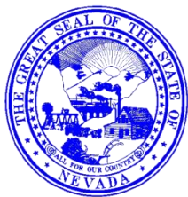
JOE LOMBARDO Governor

400 W. King Street, Suite 106 Carson City, Nevada 89703 (775) 684-7040 • Fax (775) 684-7052 http://minerals.nv.gov/